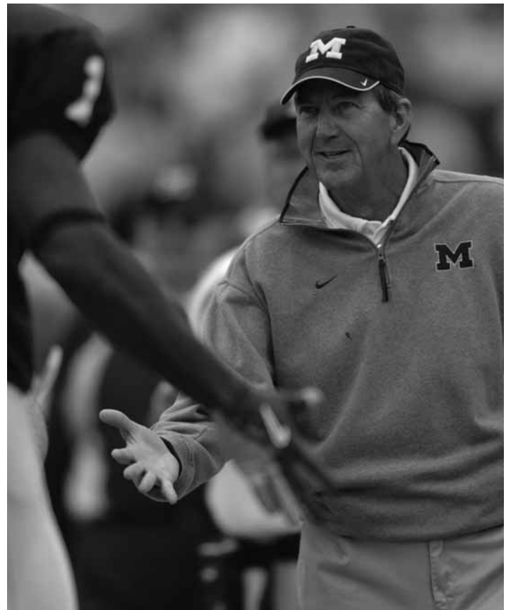
Michigan University Halls of Fame. He was inducted into the Jewish Sports Hall of Fame during the 2004 season.