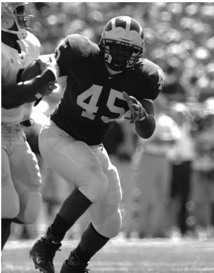
Senior inside linebacker David Harris leads the team with a career-best 80 tackles this season.