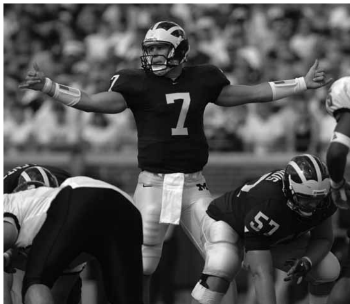
Chad Henne completed 24 passes of 20 yards or more this season, including seven scoring plays, and has 58 passing plays of 20-plus yards in two years.